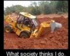
What society thinks I do.