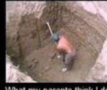
What my parents think I do.