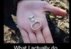
What I actually do.