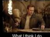
What I think I do.