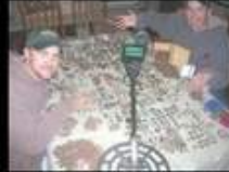
What my boss thinks I do.