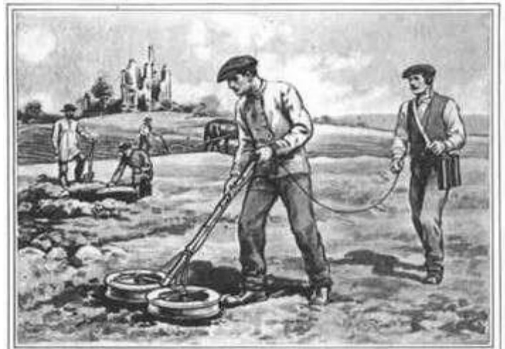
This Instrument Detects the Presence of Shells or Other Metal Buried in the Soil, Thereby Enabling the Farmer to Remove Them before Tilling a Field